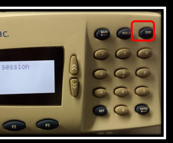
STEP 3: Select End to complete the Session